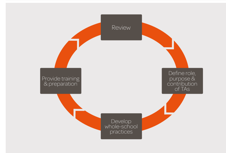
Figure 3. A process of school improvement regarding the use of teaching assistants

Figure 3 shows a model for school improvement that SLTs have previously found useful in reviewing the current use of TAs and guiding a process of change. This should shape an action plan for your school, which can then act as a foundation for training and deploying staff. Importantly, training should include supporting teachers in how to work effectively with TAs.